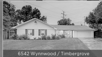
6542 Wynnwood / Timbergrove