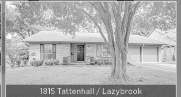
1815 Tattenhall / Lazybrook