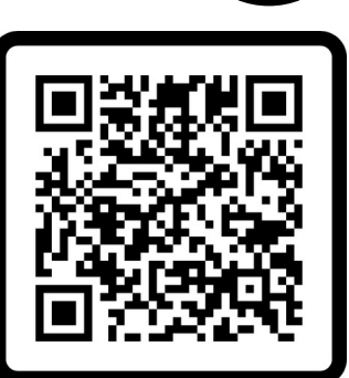
Scan with your phone here to pay and enroll online.

The Neighborhood Constable Patrol Program (NCP) is a concierge security service that is available to community residents with a uniformed presence dedicated to our neighborhood to directly address suspicious behavior, respond to criminal activity and help deter crime. Constables work in tandem with HPD and citizen patrol groups and have legal jurisdiction to confront, ticket and arrest. The officer will also be available to communicate with residents and get acquainted with their families, friends and pets. The officers schedule and hours will be determined through collaboration with the Security Coordinator(s) and the Constable's office to provide patrol during the most sensitive hours.