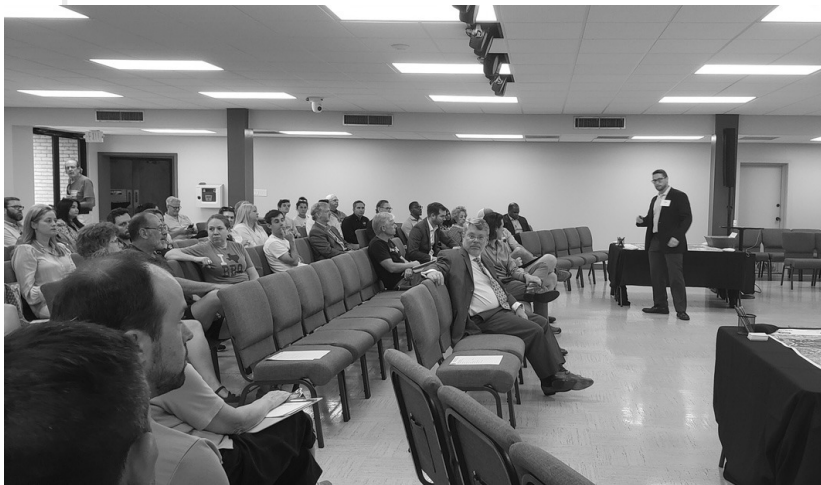
An initial meeting was held on May 11 to obtain input from the community about the current condition of our streets and drainage systems.

TIRZ-12 is completing a drainage study for the greater area and has gathered public feedback on the initial findings of street conditions. The last time a drainage study was done in our area was nearly 60 years ago—this initiative is our best chance at having input to try to alleviate our street flooding issues as the area continues to develop. An initial community meeting was held on May 11, 2022 to obtain input. Be on the lookout for notices of future meetings to learn more and make your voice heard on this important project.