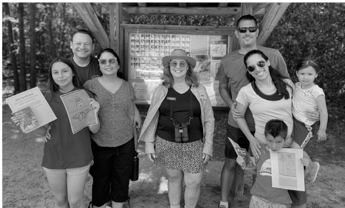
Coloring contest winners pose with their winning art and families.

That afternoon's Bird Walk turned out to be magical as we saw one Northern Cardinal and two Blue Jay active nests. By the time you read this, those baby birds will have fledged out of the nest and be well on their way to growing up in the preserve. Look for other contests to be sponsored by the Friends of The Lorraine Cherry Nature Preserve soon.