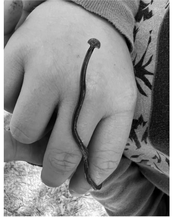
Avoid touching this toxic Shovel Headed Garden Worm!

If you see one of these worms, please immediately report them to the Texas Invasive Species Institute via email at invasives@shsu.edu along with a photo if possible. We have had a report from one preserve neighbor who found one in her yard, so keep your eyes open even at home.